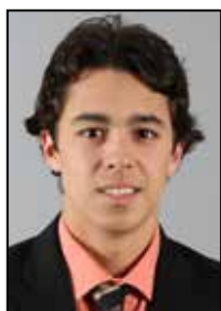
Johnny Gaudreau, BC – 2014